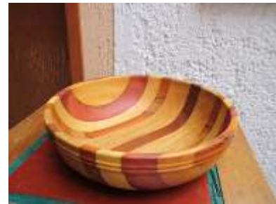
Glue Up or Laminated Turning

This will be an annual competition with no set brief to follow, you're free to turn any shaped bowl or bowl form (urn, bowl & lid, chalice etc.) that strikes your fancy. For all entries you will be judged on: