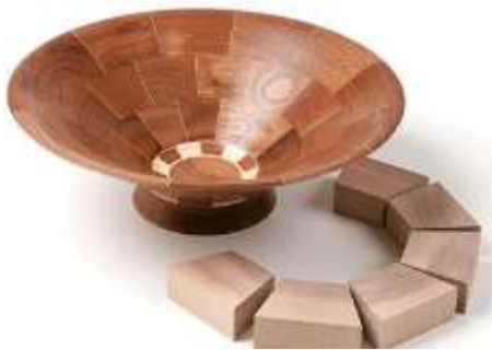
True Segmented Turning Example.

Whether the overall winner is a glue up or a true segmented piece will be entirely at the discretion of the judges.